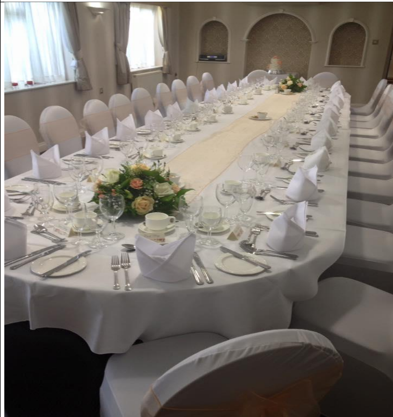
The Orchard Room: